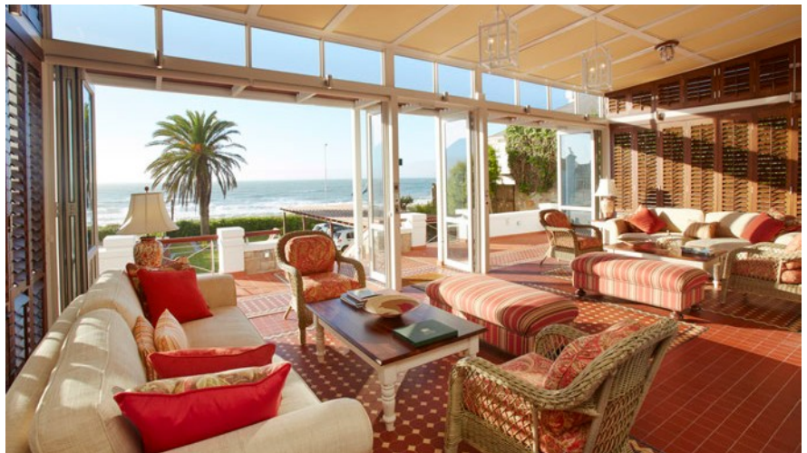
The conservatory lounge and dining area