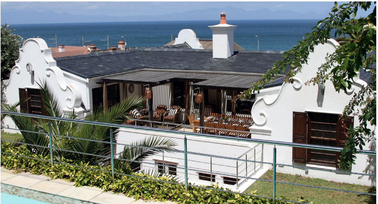
View from the pool deck over the garden to the outdoor dining space