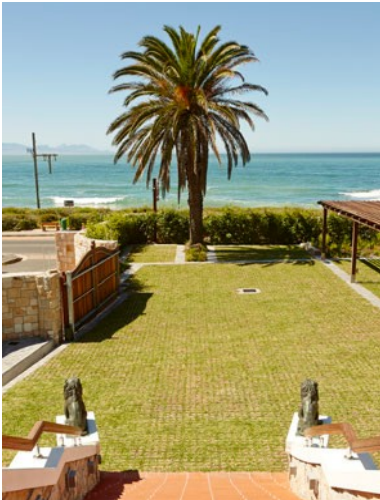
Overlooking Danger Beach from the front veranda